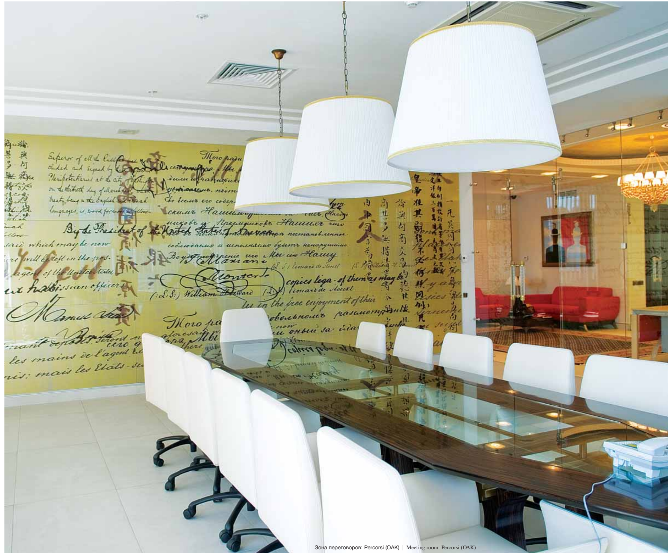
Зона переговоров: Percorsi (OAK) | Meeting room: Percorsi (OAK)

Reception, meeting room, president office, open space