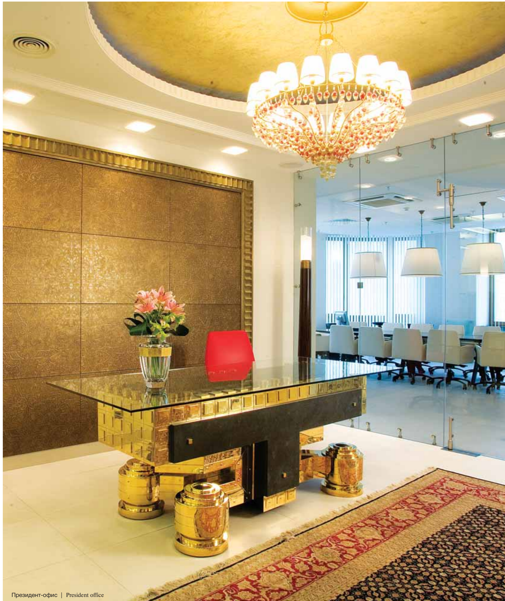
Президент-офис | President office