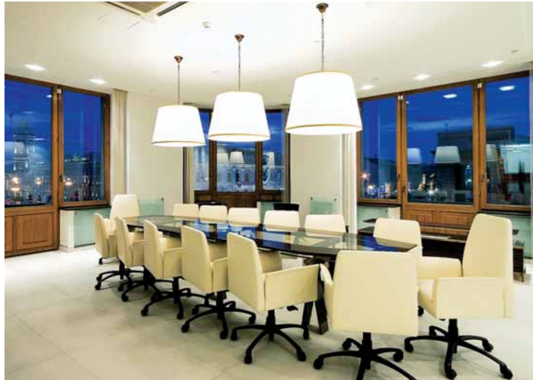
Зона переговоров: Percorsi (OAK) | Meeting room: Percorsi (OAK)