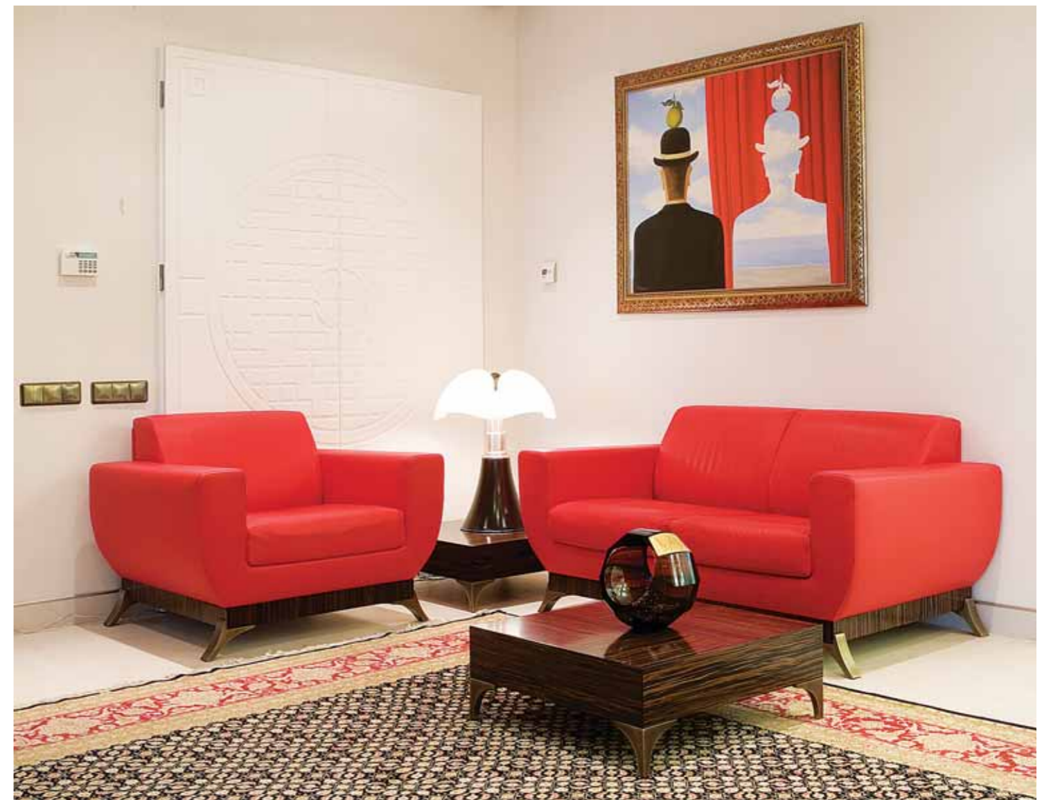
Зона ожидания: Percorsi (OAK) | Waiting area: Percorsi (OAK)