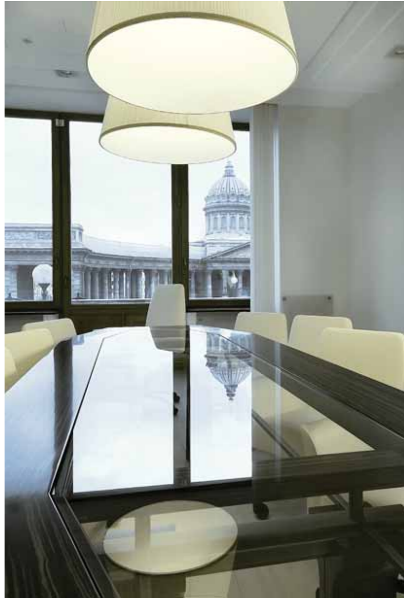
Зона переговоров: Percorsi (OAK) | Meeting room: Percorsi (OAK)